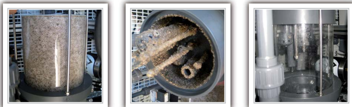
Fouling with a lot of barnacles (left/middle), no biofouling due to the -4H- Antifouling methodes (right)

Especially in coastal waters biofouling on sensor surfaces is a major problem. The -4H- FerryBox antifouling concept prevents growth of algae, barnacles or microorganisms within the system to provide a sustainable basis for reliable measurements enabling long-term operation.