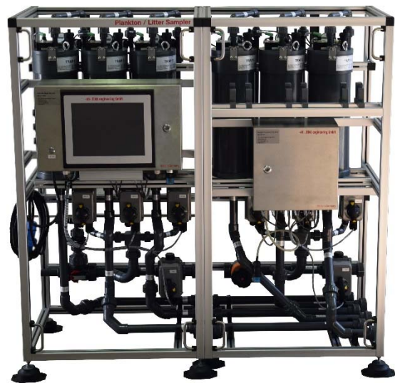
-4H-Active Sampler array (modular, 2x3 tubes)