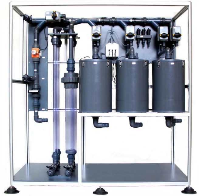
-4H-Active/Passive Sampler combination

The tubes can be cascaded from one up to an arbitrary number according to the customer needs. They are flushed with sea water through a separate water system or the outlet of the -4H-FerryBox water system. The -4H-Active/Passive Sampler is controlled by the -4H-FerryBox PC or a stand-alone PC.