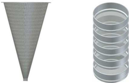
Active sampling insets such as cylindrical nets and cascaded sieves with different mesh sizes